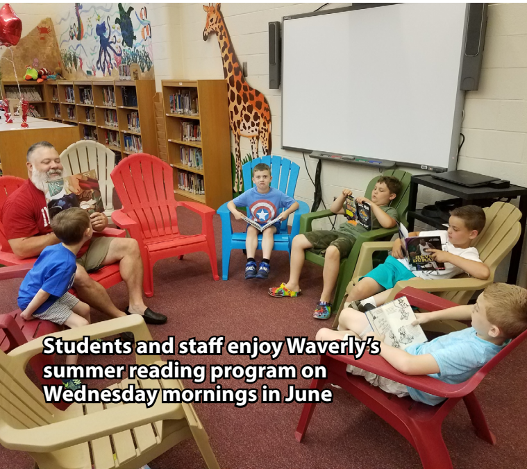
Students and staff enjoy Waverly's summer reading program on Wednesday mornings in June