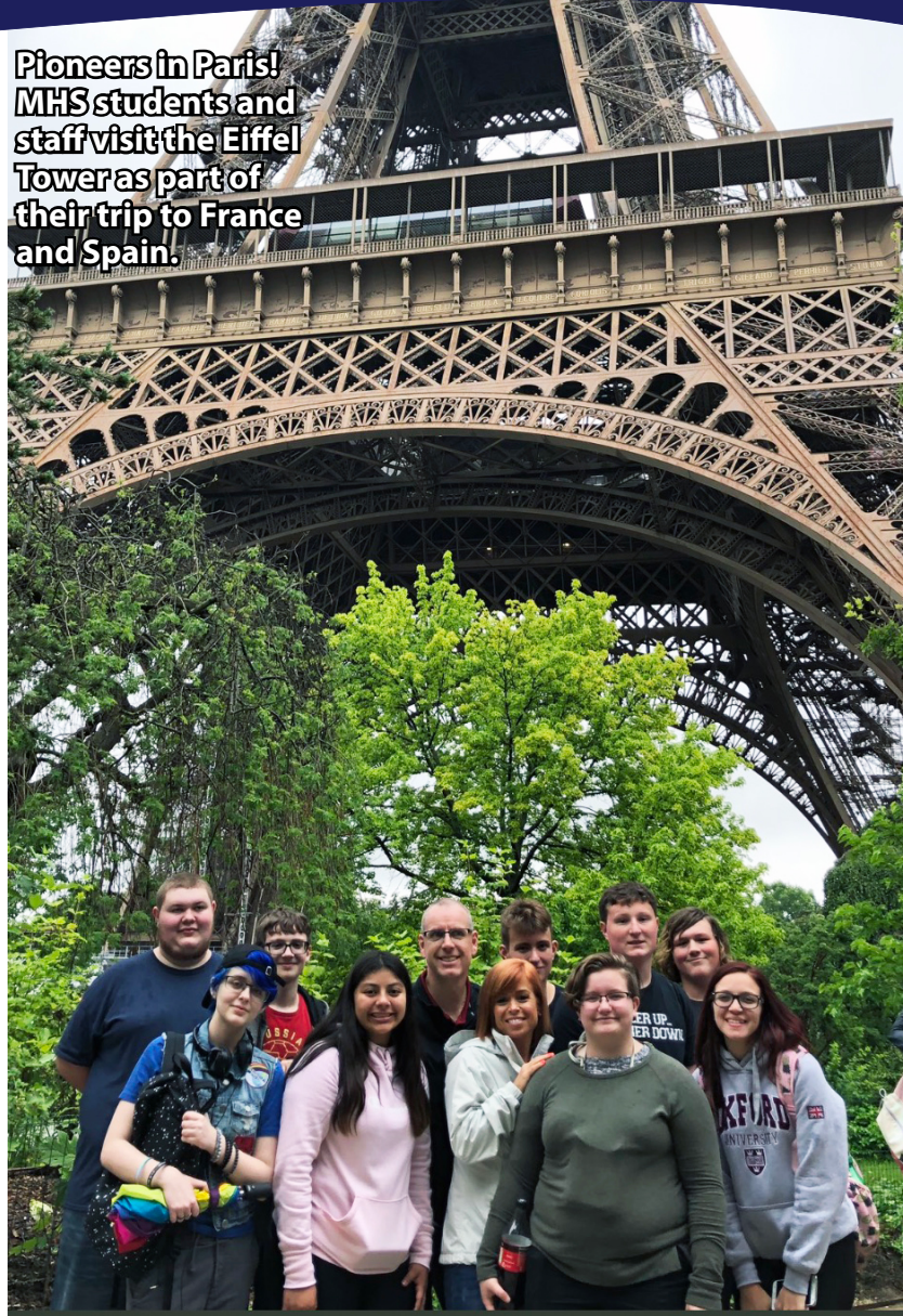
Pioneers in Paris! MHS students and staff visit the Eiffel Tower as part of their trip to France and Spain.