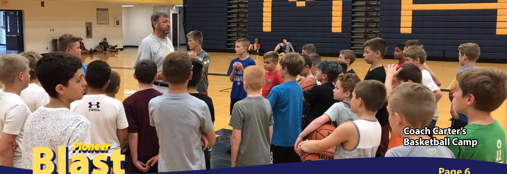
Coach Carter's Basketball Camp